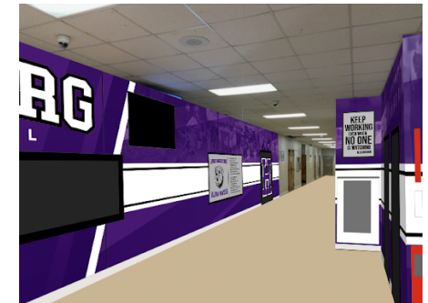
Above: 180° turn once entered building.

The Bulldog Pride Wall will welcome visitors who enter through the gymnasium doors by displaying images of all types of groups and activities that happen within the halls of Hamburg High School - classroom learning, clubs, the arts, and athletics throughout the years.