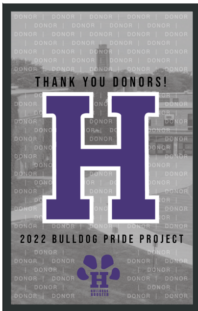
Draft of sponsorship display