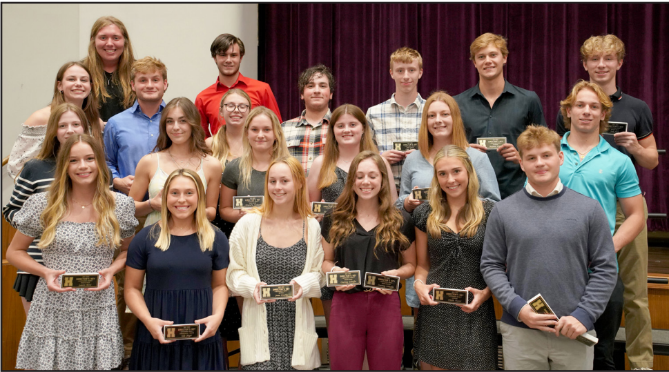
Director's Key (Outstanding Senior) award recipients.