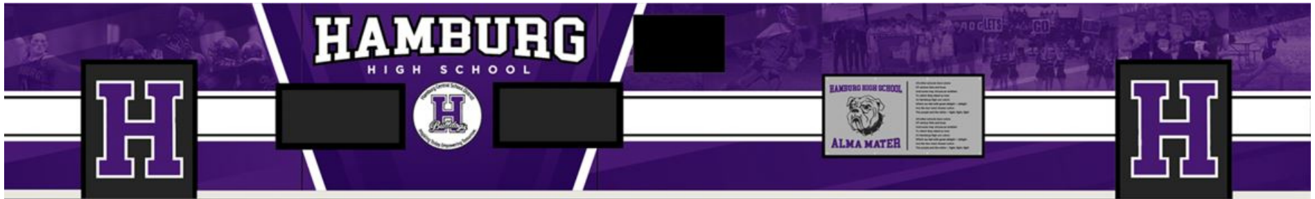
Above: view when entering in through the gymnasium entrance.

Hamburg High School Hamburg Varsity H Club