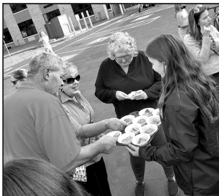
Zucchini bites were served by the Family & Consumer Science Club.