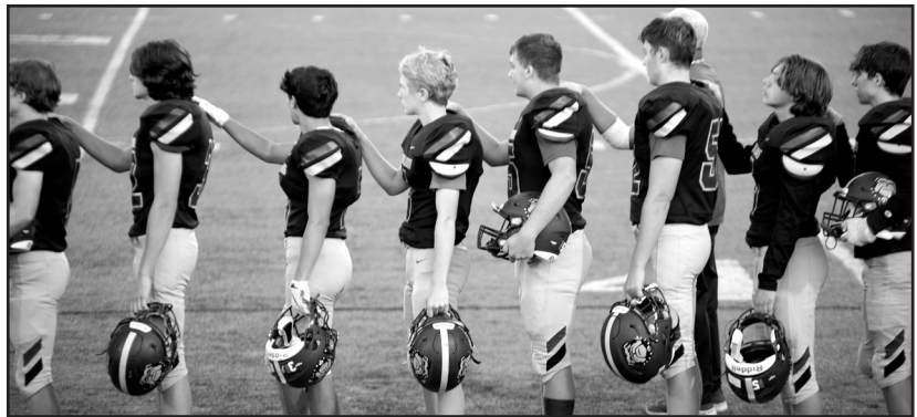
All for one and one for all as the varsity Bulldogs took the field for a win over Amherst.