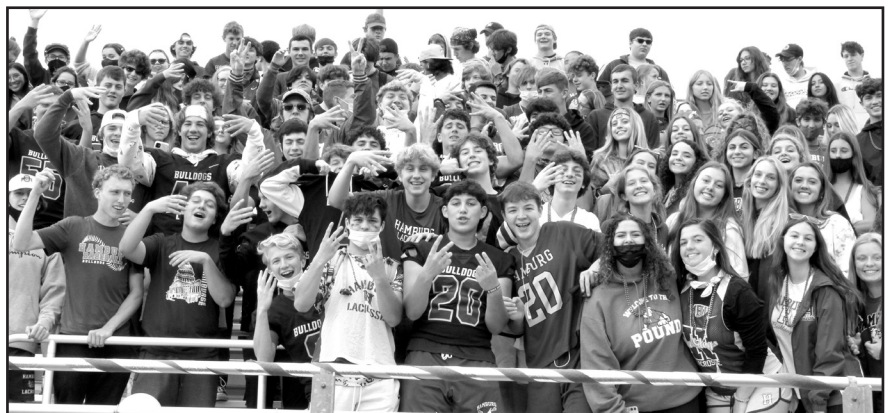
Loud and proud