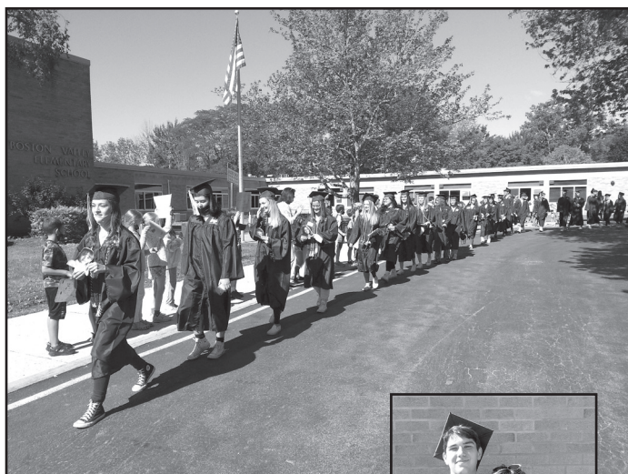
The seniors promenaded.

A Senior Memory Walk through Hamburg's elementary schools and Middle School in June gave members of the Class of 2021 the opportunity to reminisce and celebrate the path that led them to graduation. Traveling by bus from school-to-school, the seniors were welcomed by staff members and students, congratulated on their accomplishment and reminded that they would always be welcome at their alma mater. Scenes from the Memory Walk at Boston Valley Elementary are pictured.