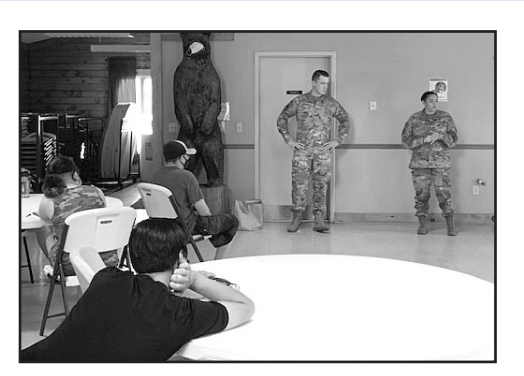
Speakers from the U.S. Air Force talked about military career options.

"It's an honor to be able to direct and work with these students every day."