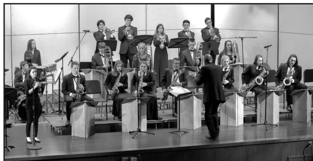
The music stands are put to use.